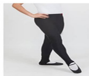
UNF0041AH Australia Majors Tights (Boys) Available in: Cotton Black